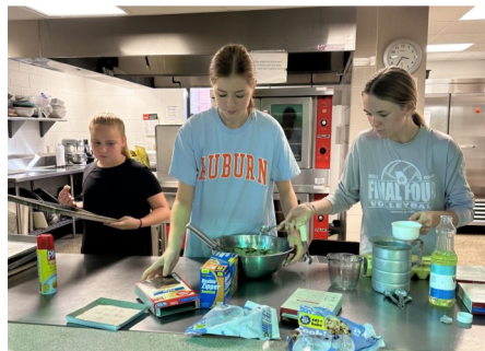
↙ Youth, Parents, and Adults packing more Blessing Bag Shoeboxes