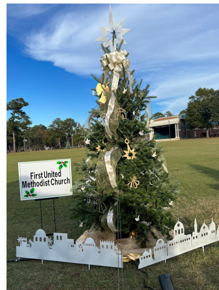
FUMC TINSEL TRAIL CHRISTMAS TREE

The Southwest Georgia Tinsel Trail is a festive display of LIVE Christmas trees at the Earle May Boat Basin. Intended to promote the spirit of Christmas and community involvement, over 100 trees are sponsored and decorated by local businesses, groups, or families. The display is free to the public and open all hours of the day and night! We invite you to experience this joyful display of holiday spirit by talking a stroll through the display or driving your vehicle, as Tinsel Trail is accessible by foot or by car. Southwest Georgia Tinsel Trail connects to the Lights Along the River Christmas light display that winds along the banks of the Flint River.