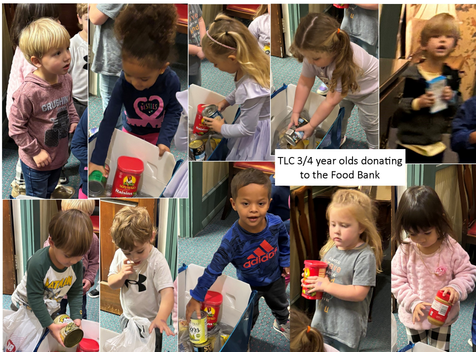
TLC 3/4 year olds donating to the Food Bank