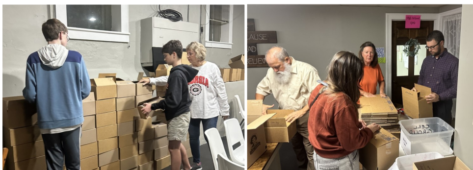
↔ Youth, Parents, and Adults packing 300 Blessing Bag Shoeboxes for Lifeline Ministries.